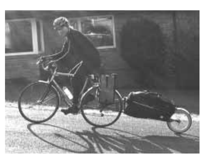
Me, commuting on a sunny winter day in November. Notice I'm smiling even though I'm pulling over 100 pounds up the hill. That's what comfort can do for you;-)

I guess the moral of the story is: Treat your commuter as your prized possession, and it'll keep you wanting to ride all year. There's no reason to think of it as a throw away bike.