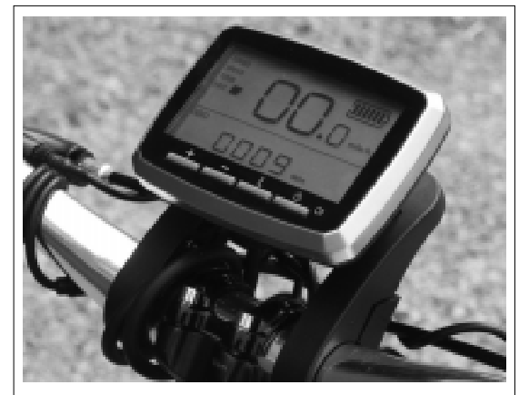
Control panel mounts on handle bars.