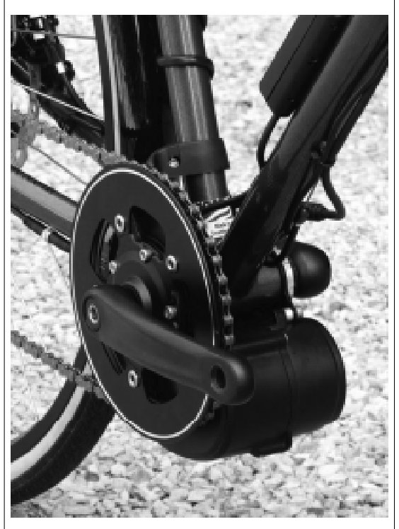
Motor mounts cleanly underneath bottom bracket.